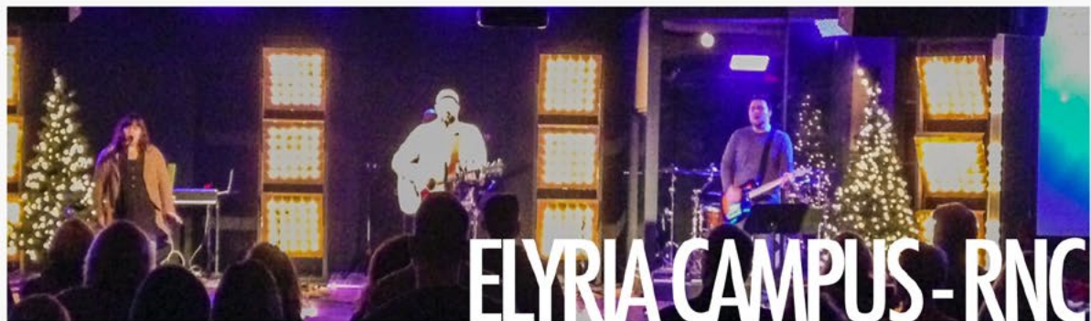
ELYRIA CAMPUS - RNC