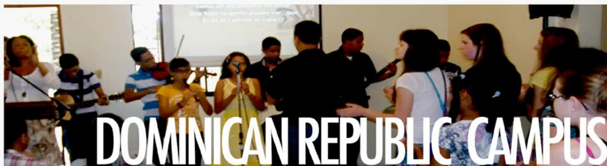
DOMINICAN REPUBLIC CAMPUS