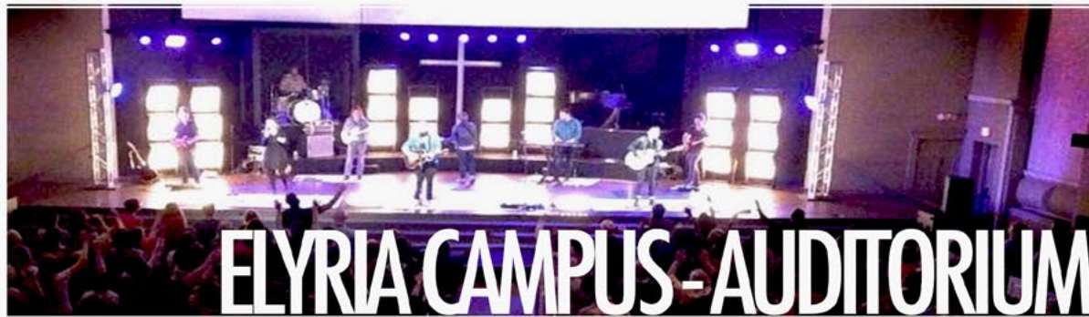
ELYRIA CAMPUS - AUDITORIUM