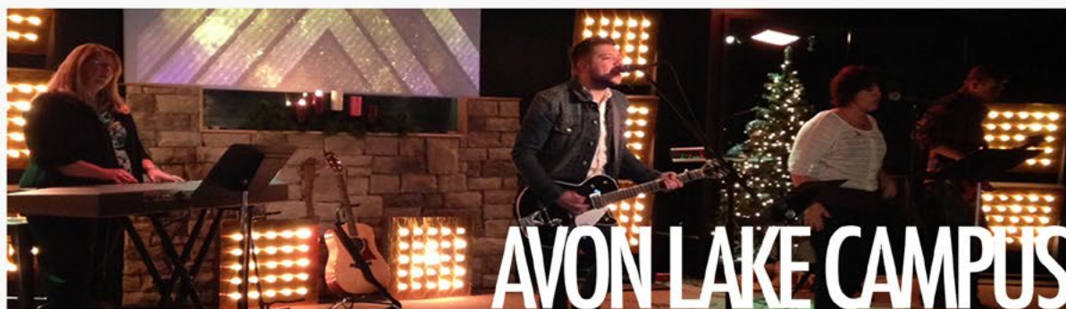
AVON LAKE CAMPUS